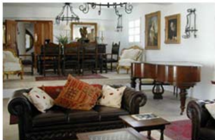
Spacious lounge / dining room including a grand piano, desk and fireplace

and 3 reception rooms providing uninterrupted breathtaking views of the mountains and sea. This enchanting venue also boasts a large entertainment area, swimming pool and wonderful terraces. It is also within minutes of a delightful little beach with 3 Greek Tavernas.