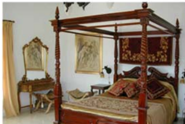
The Gerasimos Suite

The Dorothea is yet another sumptuously furnished room, also boasting sea and mountain views. It has a beautiful sleigh double bed with an en-suite shower room. Double doors open onto the large terrace overlooking the pool and landscaped garden.