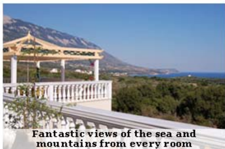
Fantastic views of the sea and mountains from every room