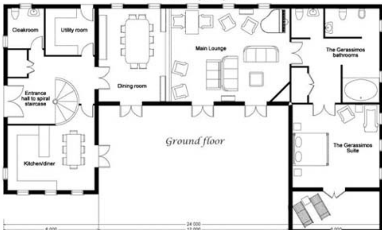
Villa Loukia floor plan