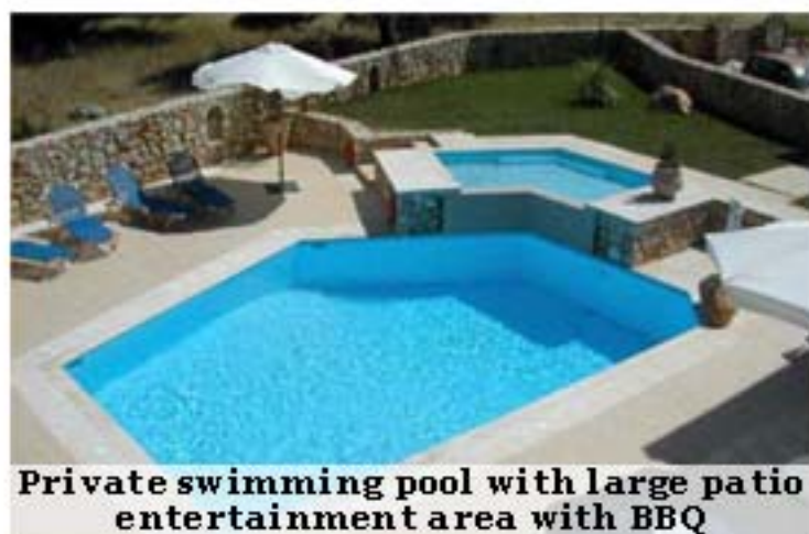
Private swimming pool with large patio entertainment area with BBQ